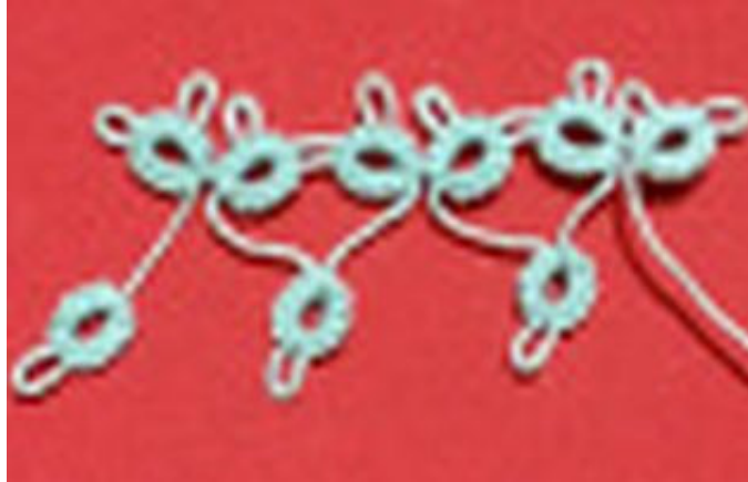
One Thread Edging No. 1 Pg. 1 New model tatted by Shanan Strode

Forty Original Designs in Tatting By Nellie Hall Youngburg Novel and Unique Designs with Complete Instructions for Every Pattern Designed and Executed by Nellie Hall Youngburg, Brookings, SD© 1921. As a summer tatting project tatters in the Online Tatting Class have been rewriting and modernizing the patterns in this vintage tatting book. Diagrams and new models have been prepared to help the tatter follow the patterns more easily. Both the original public domain booklet and the new version are being posted online to share with all tatters everywhere.