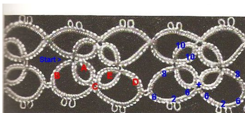
EmmyLiebertbk1fig83pg41reprintpg39 83 u. 84.