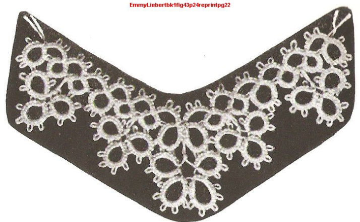
43. Die untere Spitze des Beutels Abb. 42.