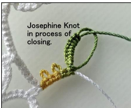
Josephine Knot in process of closing.

Continue from ** until you have tatted all the way around the center, but when you reach the last picot of the 3 rd ring of the final trefoil, join to the 2 nd picot of the first small ring ( a folded join will be needed for this ). Then tat last chain.