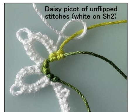
Daisy picot of unflipped stitches (white on Sh2)

Ch 7, join to nearest picot of center ring of trefoil, 7 - 2. RW.