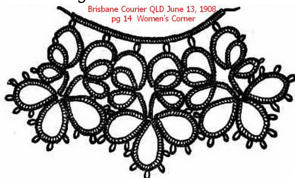
Diagram of pattern from the 1908 Brisbane Courier

This pattern appeared was published on BellaOnline.com in Oct.2014. It inspired one tatter to adapt it for modern earrings.