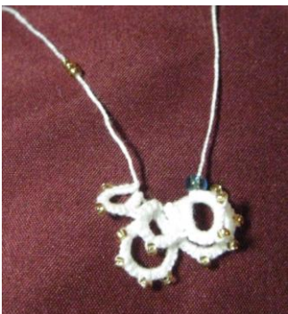
R5 is closed. In preparation for R6 place 3 beads on the thread we have been using up to this point. If using only one needle, take it off this thread and put it on the thread saved at the beginning. If you have 2 needles put the second needle on the beginning thread and put 1 bead on this thread (I used a special bead for this one because it ends up in the middle).