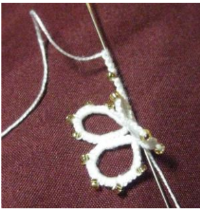
This picture shows how R1,R3 and R5 are joined as well as R2 and R5 before R5 is closed.