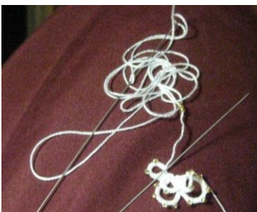
Place the Needle that is on the beginning thread at the base of R5. Complete the stitches up to the point of the FR using the same thread used for R1-5.