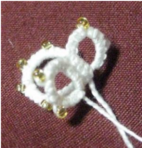
Another angle showing the same join of R3 to R1.