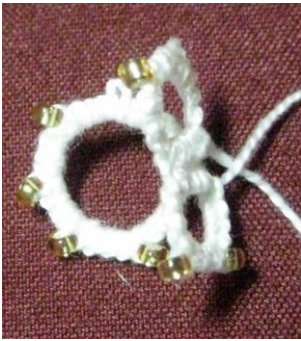
This picture shows the join of R3 to R1.