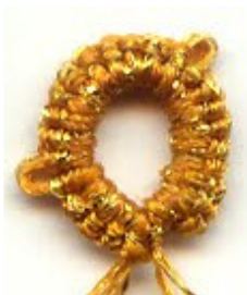
Finished Ring 1