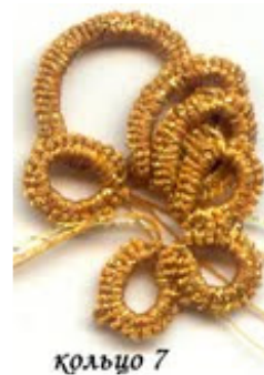
Finished Rings 1 - 7

After completing Ring 6 start Ring 7) R: 5 + (to R6) 10 – 10. Work from the same point. As you see Ring 7 mirrors Ring 1.