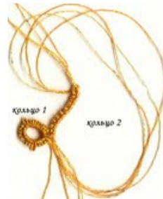
Starting Ring 2 from the same point.

2) R: 10 + (to R1) 30 – * 5 – * 5 – * 20. When you reach joining to R1, place R1 on top of already tatted 10 ds of R2.