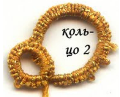
Finished Rings 1 and 2