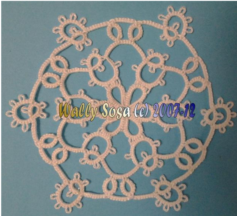
BD Motif 2012 Wally Sosa ©2007-12